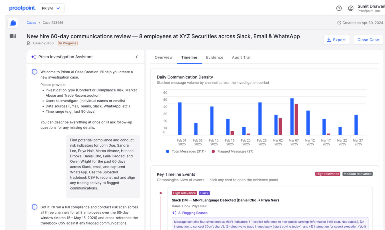
Figure 2: Proofpoint Prism Investigator reconstructs the events chronologically.