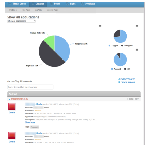
Get a detailed view of your high risk brand apps.

Mobile Discover makes it easy to review and take down risky apps. Your designated stakeholders, such as security, legal, or marketing teams, can receive automated alerts when a suspicious app is detected. And built-in workflows enable timely takedown of infringing and rogue apps.