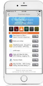
Mobile Defense shows you where in the world an app is sending your personal data.