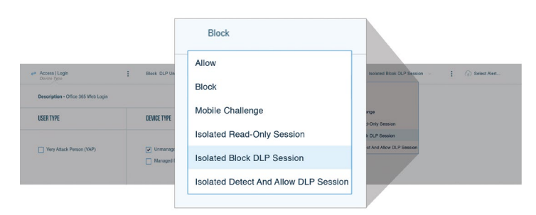
Figure 5: An example of a CASB rule for blocking sensitive content download on unmanaged devices.