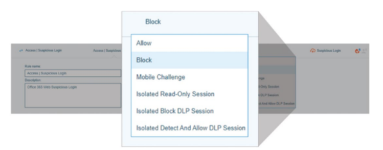
Figure 2: An example of a CASB rule for blocking suspicious logins.

When an attacker's signature is already known to Proofpoint, you can use CASB's adaptive access controls to prevent their highrisk suspicious logins. Proofpoint tracks suspicious logins across tens of millions of accounts and has the best understanding of cloud threats. For example, you can block access to your highly attacked user accounts when CASB detects a suspicious login.