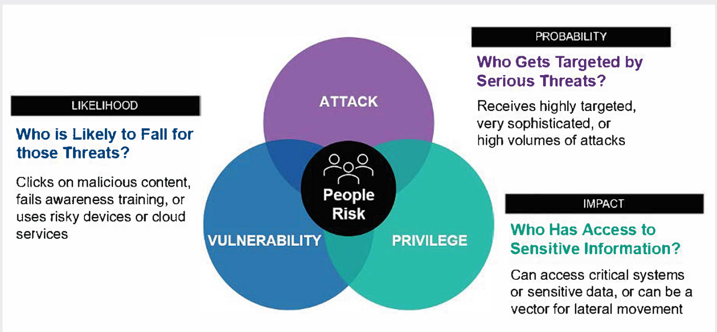
Figure 1: Venn Diagram showing how Proofpoint views the variables that intersect to inform risk.