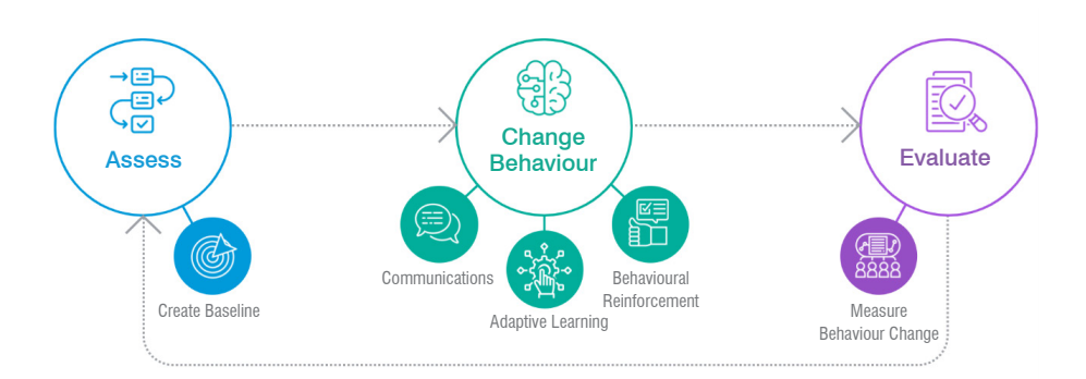
Figure 1: The Proofpoint ACE (assess, change behaviour, evaluate) framework.

Proofpoint takes a holistic approach to security awareness training. Our ACE framework—which involves assessing the current state of your security solution, changing behaviour and evaluating the results—allows you to drive behaviour change and improve your security awareness programme over time.