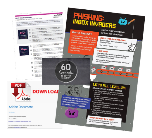
Figure 3. Proofpoint features a wide array of educational styles and formats to cater to your users' best learning needs.