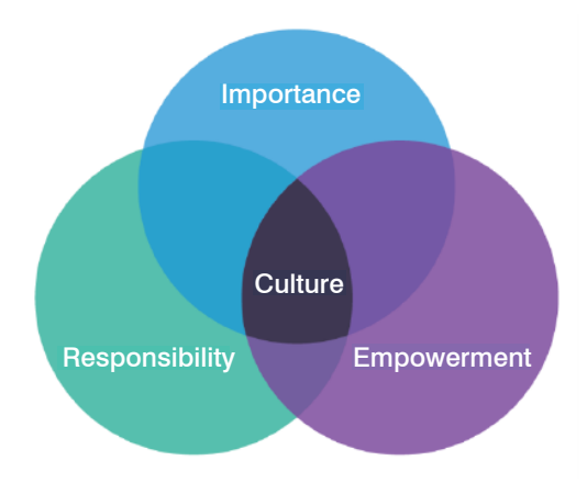
Figure 5: Overlapping factors contributing to security culture.