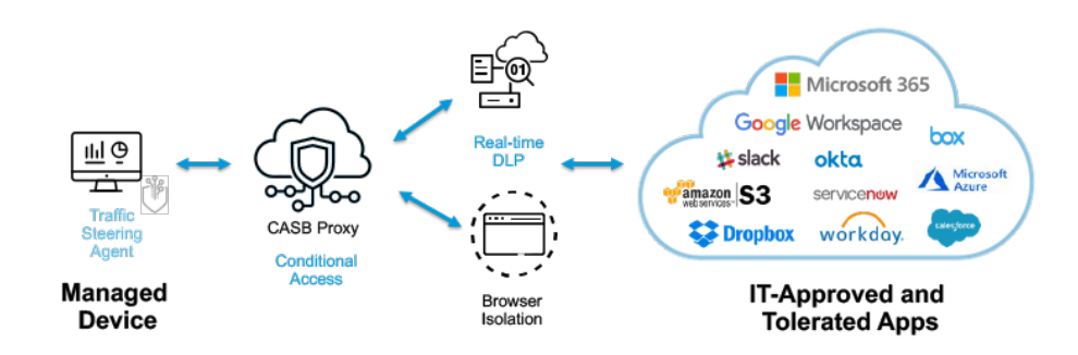
Figure 1: How Proofpoint CASB Proxy protects your cloud apps.