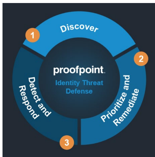
Figure 2: Proofpoint Identity Threat Defense platform.