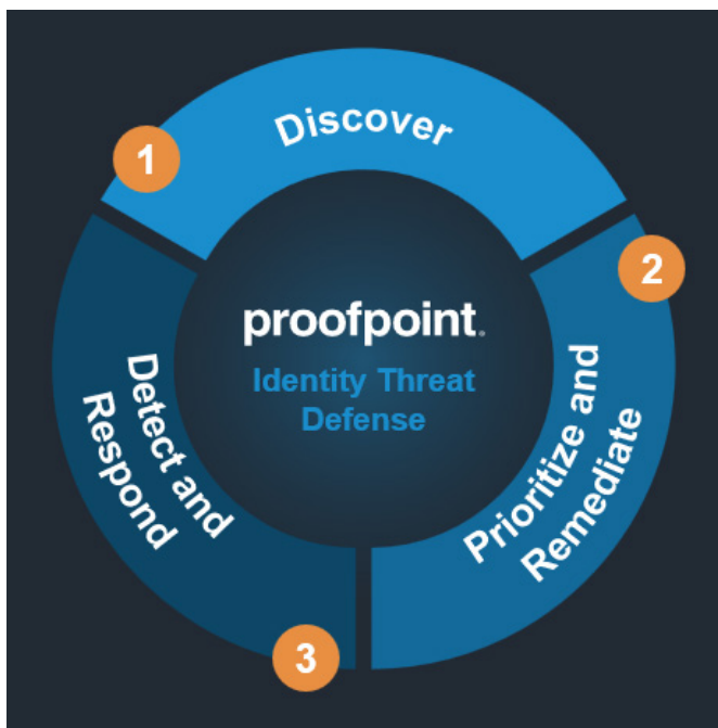
Figure 2: Proofpoint Identity Threat Defense platform.

Proofpoint research shows that 1 in 6 enterprise endpoints, both clients and servers, contain identity vulnerabilities. And this is even when traditional identity and access management (IAM) solutions are in place. Attackers exploit these vulnerabilities to gain access to admin privileges. When they first land on a host, that host is rarely their end target. They seek to move laterally within the network