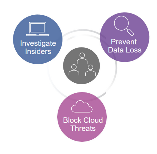
Figure 1: One Console, One Agent, One Cloud-native platform, with common alert management and investigations, policy uniformity, privacy controls, reporting and analytics.