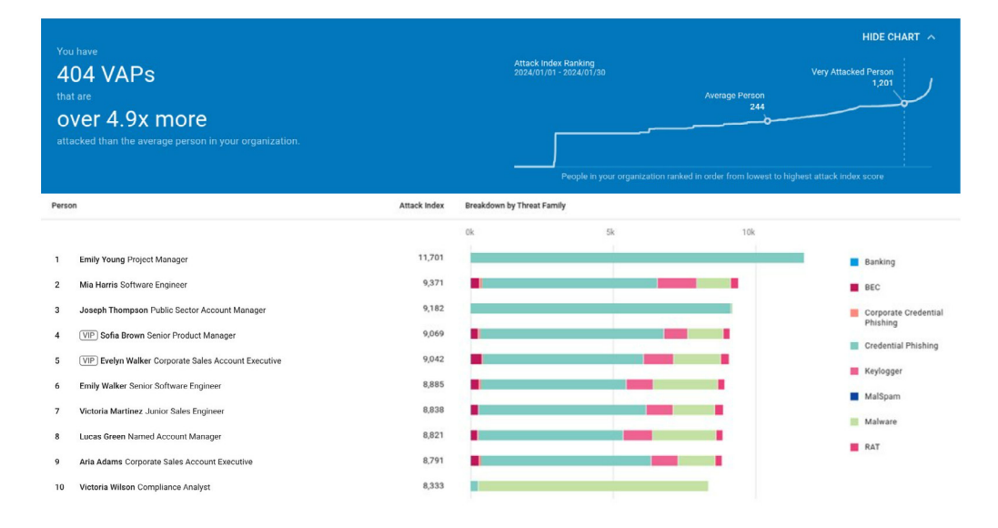
Figure 2: Proofpoint provides people-risk visibility into your Very Attacked People™ (VAPs).

Proofpoint helps you further mitigate your people risk by changing unsafe behavior and building sustainable security habits. We use our rich threat intelligence to inform your program in various ways. These include designing real-world phishing simulations, enabling threat-guided training that allows you to educate your top clickers and most attacked, and automating threat investigation of user-reported email. We help you keep users engaged by providing you with personalized learning experiences. Our adaptive approach helps your people retain what they learn and cultivate positive and lasting security habits. And we allow you to better communicate your people risk and program impact to your leadership team by tracking real-world behavior change and benchmarking it against your industry peers.